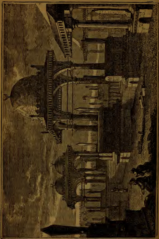
Tombs of the Mamelukes.